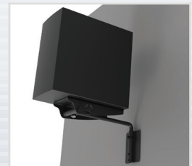
Wall Mount Down

Ideal venues include recording studios, post production facilities and where ever reference listening is required