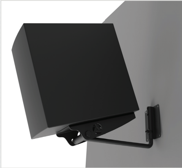
Wall Mount Up

The MM-705-WM is a pan and tilt wall mount specifically designed to support the JBL 705P studio monitor. Save counter space by mounting these monitors to the wall. Independent adjustments allow the speaker to be precisely aimed and locked into position to provide optimum stereo and surround sound listening.